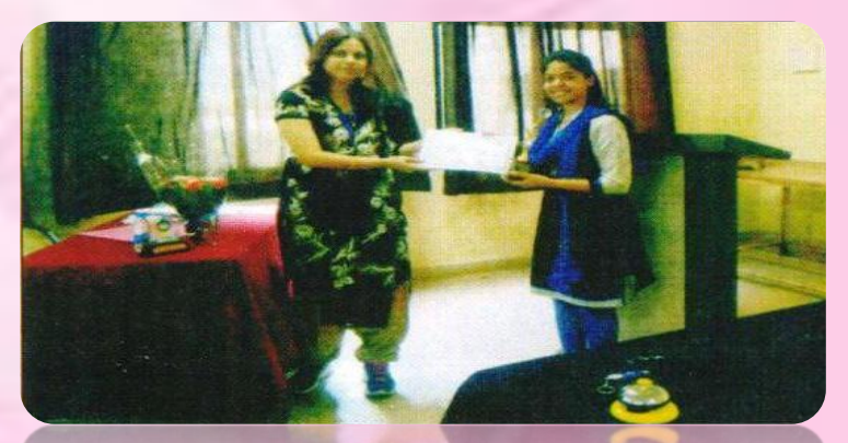
Best Paper Award for paper titled 'Face Recognition using Radial Curves & Back Propagation Neural Network' (2015) 13