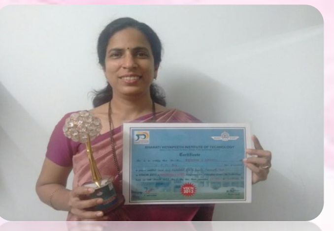
1<sup>st</sup> Prize for the paper titled 'Grid & Distributed Networks to handle Mammoth Tasks' (2013)