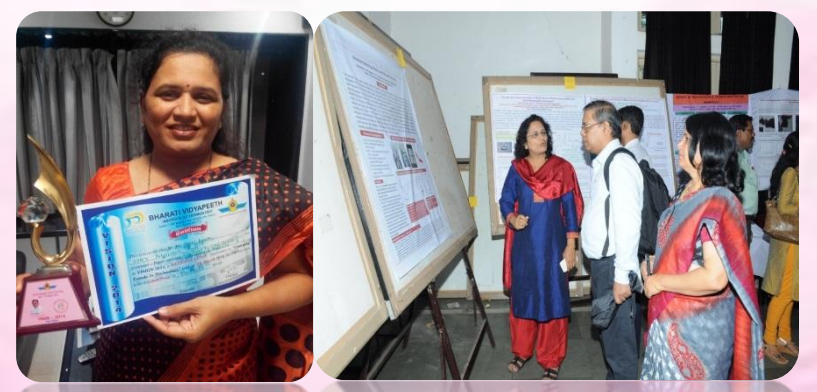
2<sup>nd</sup> Prize for the paper titled 'Simulated Resistive switching behavior of V.P.NMemristorc (2014) Thane