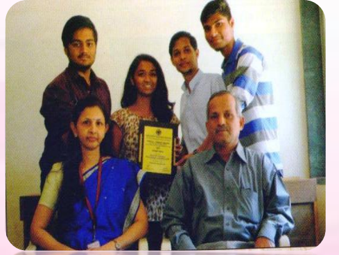
ISTE-NM Award 2015 for Best Project (Second Prize) Project- Thermostat Life V.P. Mestinglytechnic, Thane

ISTE-NM Award 2013 for Best Project (Third Prize) Project- Gesture Controlled Robot