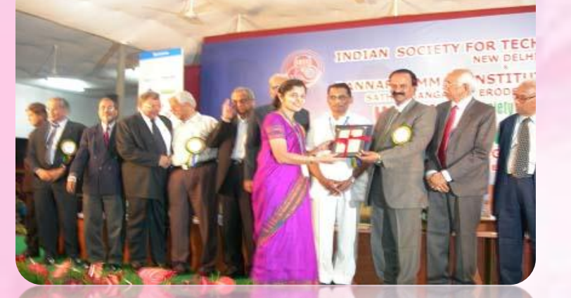
ISTE L & T National Award for Best M. Tech. Thesis in Electrical & Electronics Engineering (2006)