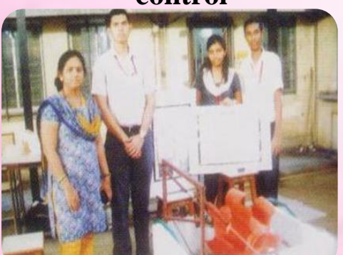
ISTE-NM Award 2012 for Best Project (Second Prize) Project- Open Hydro turbine System

International Project exhibition Award 2015 for Best Project (Third Prize) (Brazil) Project-Smart Building Automation Controller using ardunio, sensors, outrelay control