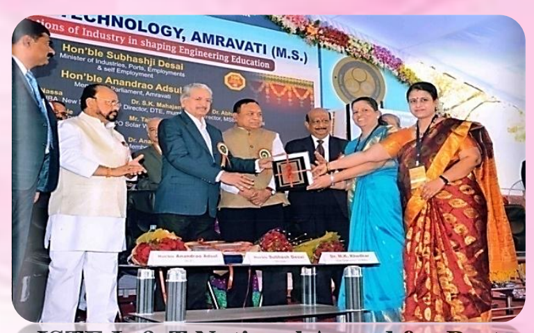
ISTE L & T National Award for Best M. Tech Thesis in Electrical & Electronics Engineering (2015)