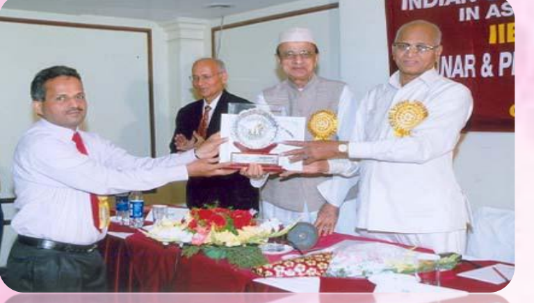
Rashtriya Vidya Saraswati Puraskar (2007)