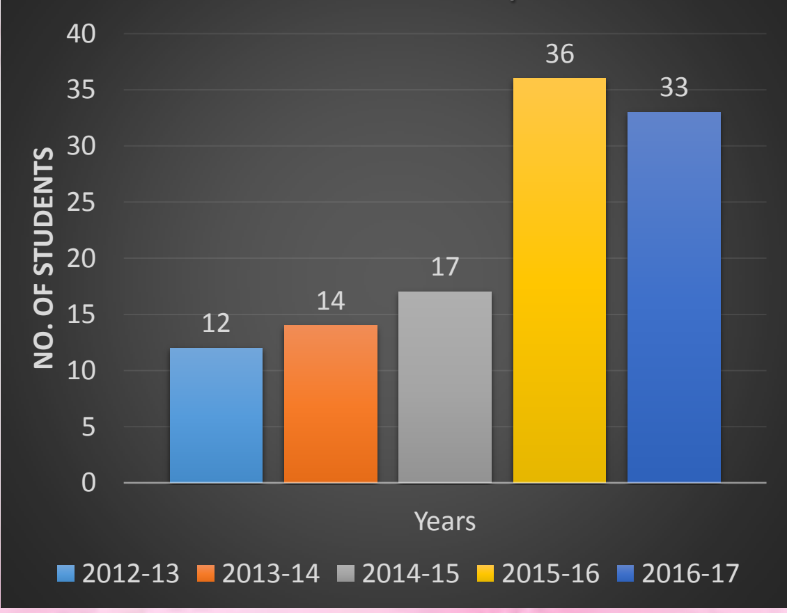
Awards in various Competitions