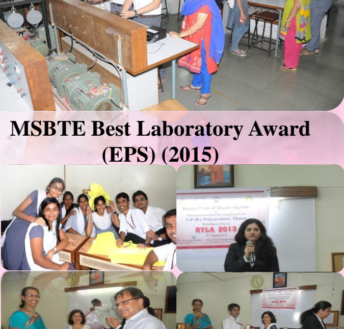
Start of Entrepreneurship Development Cell (2011)

Best ISTE-Chapter in Maharashtra-Goa for the